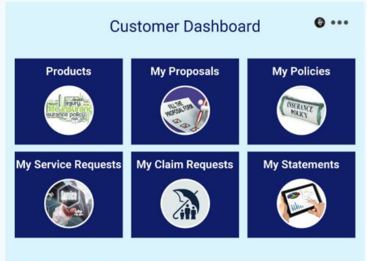
* Samples of menus for indicative purposes

Amity i Broker is a complete ERP solution for Insurance Brokers, enabling in design of customized and personalized insurance solutions for customers. It leverages cutting edge technology combined with their knowledge and experience for increase and retention of business for different customer segments. Amity i Broker helps the Insurance Broker perform this role effectively and efficiently.