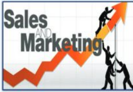
Marketing & Sales